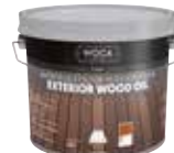
OIL-WOCA-011 Woca Exterior Wood Oil Teak 2.5 ltr