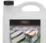
CLEANER-WOCA-01 Woca Exterior Wood Cleaner 2.5 ltr