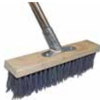
BROOM-02 Silicon carbide broom